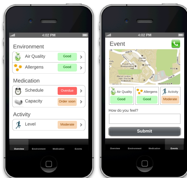
Figure 2. Sample Asthma Patient Smartphone Application