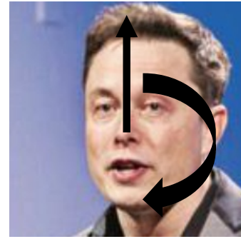
Figure 3. The map to V1 starts at the vertical meridian and proceeds clockwise from there.

For our model, we have chosen to simplify Polimeni’s model map to the visual cortex in two ways. The first is in the visual cortex itself. Instead of mapping to V1, V2, and V3, we are only concerned with primary visual cortex (V1). Our focus is on studying the mapping from the visual field onto the visual cortex as a possible factor in the explanation of the face-inversion effect. Because of this, we do not model the mapping of the visual field onto higher visual areas, nor did we model anatomically where the stimuli are