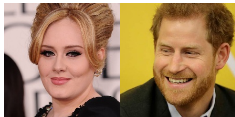
Figure 4. Images from face dataset

In the rotation experiment, we rotated the training images to commonly observed head orientations: 20^\circ , 10^\circ , 0^\circ , -10^\circ , and -20^\circ . To study the face inversion effect, we also rotated testing images to 180^\circ for testing (not included in training). For each case of rotation, we first found a bounding box around the face and then took the log polar transformation from the center of the face, similarly to the scaled images. After the images have undergone a log polar transformation,