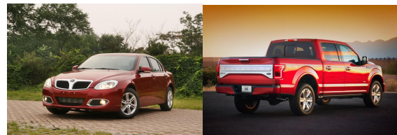
Figure 5. Images from The Comprehensive Cars Dataset