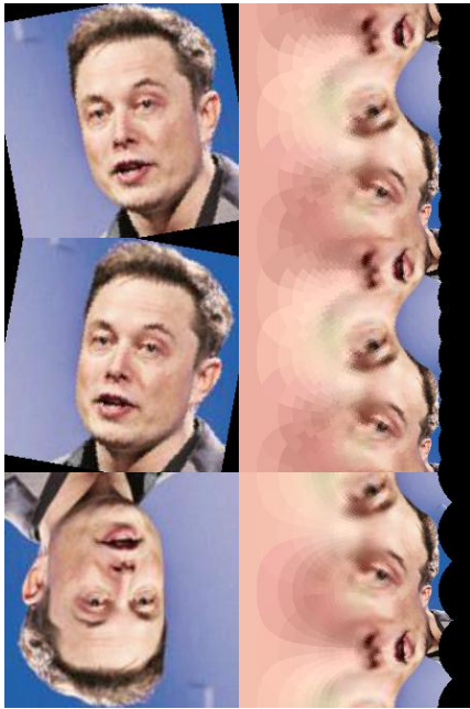
Figure 2. Rotation is a vertical translation

the visual field onto a 2D representation of cortical space. In this map, a wedge map is a compression of the image in the visual field along the azimuth, and the conformal dipole mapping “is an extension of the standard log-polar or complex logarithm mapping” (J.R. Polimeni et al., 2006).